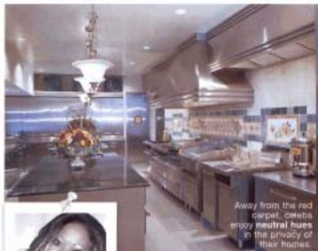
Away from the red carpet, celebs enjoy neutral hues in the privacy of their homes.